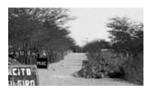
Security zones guarded by the military (2007)