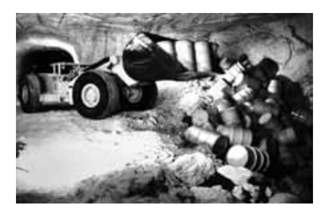
Barrels full of radioactive waste being unloaded in the Asse II salt mine

Brunswick against the Minister for the Environment, Hans-Heinrich Sander, on account of his illegal handling of radioactive substances. By doing so, they hope to enforce the closure of the mine under the Atomic Energy Act and also secure publicity of proceedings. This is only what the electorate would have expected of the Green Party fraction in the Bundestag, while it was still in power!