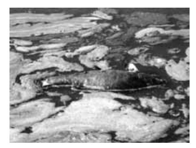
Dead fish floating in a eutrophicated lake

organic contamination. Instead, the decomposition processes caused by the aerobic bacteria produce toxins, such as hydrogen sulphide, ammonia or methane, and the stretch of water becomes polluted and "dies". This in turn leads to the dying of fish. According to reports by the U.S. National Oceanographic and Atmospheric Administration (NOAA), eutrophication of this nature has caused mass mortality of marine animals in the Gulf of Mexico. Satellite pictures have revealed a similar phenomenon of colossal dimensions in the northern region of the Caspian Sea, to the east of the Volga Estuary. These zones are then referred to as "dead zones" because hardly any marine creatures can survive there.