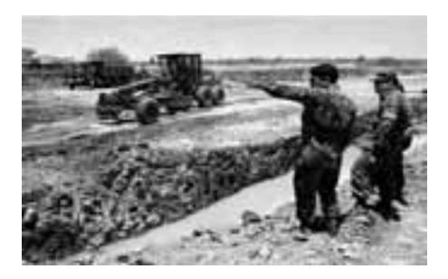
Soldiers stand guard as preliminary construction work is carried out in preparation for the transposition of the Rio São Franciso (2007)