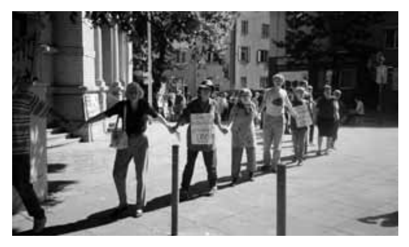
A protective human chain encircles the Bismarck School in Stuttgart Feuerbach. The city council had planned to sell this school along with 26 others in Cross Border Leasing deals

It is possible that private enterprises, too, have long since discovered similar forms of "tax optimisation" and are causing hitherto unknown amounts of revenue losses through CBL deals. Critics suspect that banks such as the Deutsche Bank, various provincial state banks and Debis (DaimlerChrysler) are using highly complex constructions to write off investments in connection with CBL transactions, for example via "intermediate companies" in tax havens such as Bermuda or Barbados.