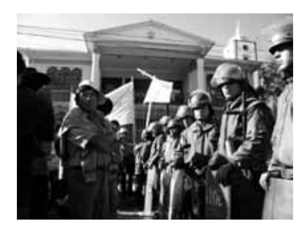
Water activists protesting outside the Town Hall in Tiquipaya, Bolivia

For years, 40 per cent of the inhabitants of El Alto, particularly those in the poorer neighbourhoods, had been waiting for their districts to be supplied with tap water and connected to the sewerage mains network. Suez had knowingly formulated the contracts so as to limit its responsibility to cover only the existing infrastructure, which meant that, as the township grew – and El Alto grew considerably – the company was under no obligation to extend its services to new areas.