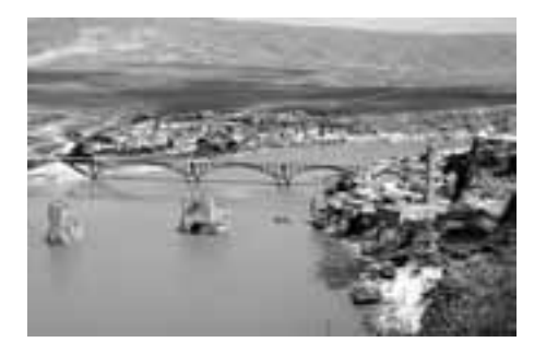
The proposed site of the Ilisu Dam and the town of Hasankeyf

credit insurance, even though the amount of borrowing itself would be comparatively low as a result of these salami tactics.