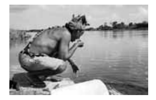
An Indian from the Tumbalalá tribe on the banks of the Rio São Francisco near Curaçá