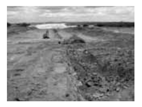
Excavators dig out a new river bed (2007)