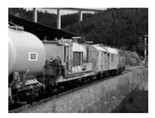
One of German Railways' special trains spraying the track bed with herbicides

used for this purpose. The German Railways "line-spraying trains" cause an enormous amount of direct and on-going contamination of our drinking water supplies. The overall length of the rail network in Germany amounts to more than 74,000 kilometres and approximately 5 kilogrammes per kilometre are sprayed each time. The loose gravel allows the toxins to seep into the soil and therefore enter the hydrological cycle.